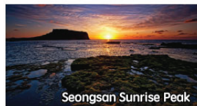
Seongsan Sunrise Peak