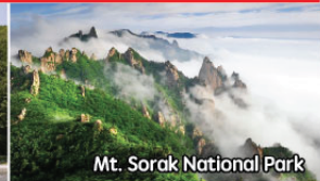
Mt. Sorak National Park