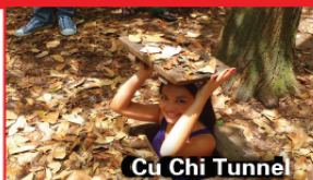
Cu Chi Tunnel