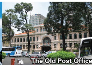
The Old Post Office