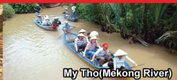
My Tho (Mekong River)