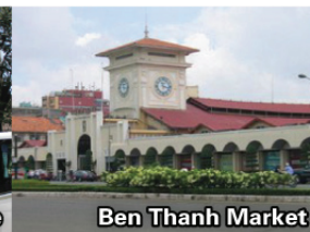
Ben Thanh Market