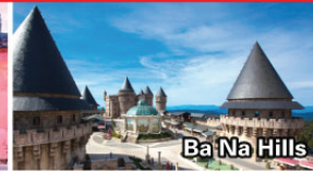
Ba Na Hills