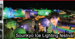
Sounkyo Ice Lighting festival