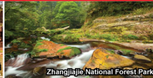
Zhangjiajie National Forest Park