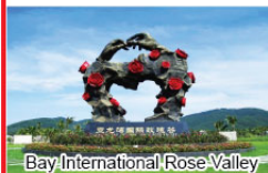
Bay International Rose Valley