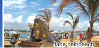
Jade belt beach