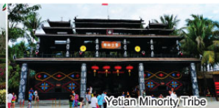
Yetian Minority Tribe

Optional Tour : *SANYA – Sanya Romance Park Show (RMB 280)