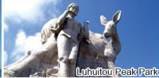
Luhuitou Peak Park