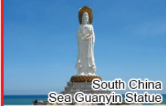
South China Sea Guanyin Statue