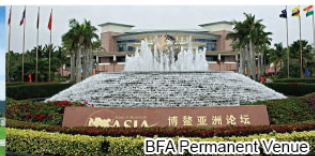
BFA Permanent Venue