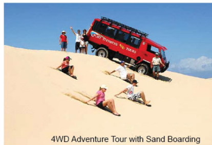
4WD Adventure Tour with Sand Boarding