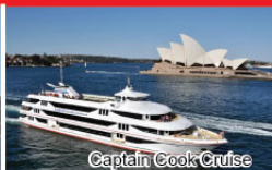
Captain Cook Cruise