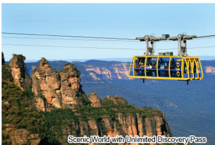
Scenic World with Unlimited Discovery Pass